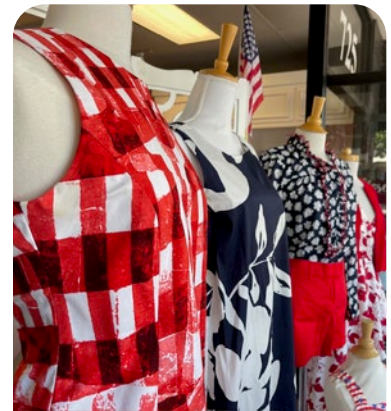
LET'S TALK SHOP! Visit www.theshopmenlopark.org/blog to read the latest blog post from The Shop. Check back every couple of weeks to keep up to date on what's happening at The Shop.