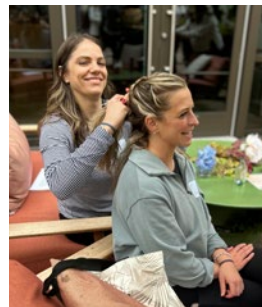
On April 19, 125 women attended our 4th annual BLOOM WELLNESS RETREAT held at Canopy Menlo Park. It was a day dedicated to confidence—the confidence to lead boldly, live authentically, and thrive in every aspect of our lives. Attendees enjoyed self-care stations, keynote speakers, workshops and breakout sessions for networking.