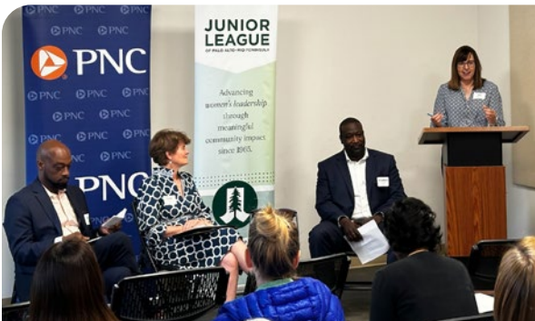
The Endowment Fund Board co-hosted the NEXT GENERATION NONPROFITS Training in partnership with PNC Bank, inviting members and local nonprofit leaders for a discussion of the top challenges and opportunities faced by nonprofits today and how to navigate these times of uncertainty.