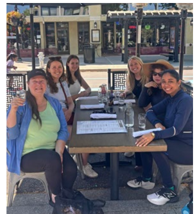
At our MAY INTEREST GROUP MEET-UPS , members enjoyed a hike and happy hour treats at Eureka! in Mountain View and the next weekend had brunch and took a market stroll at State Street Market in Los Altos.