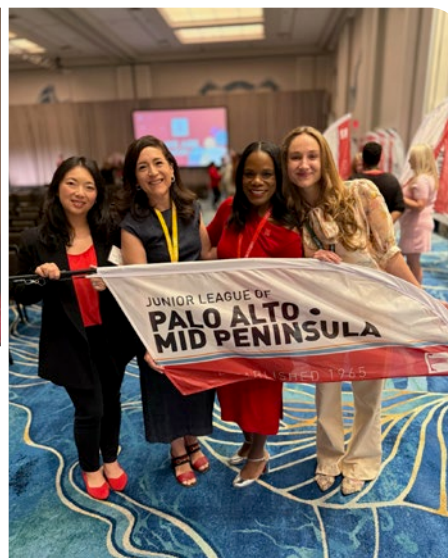
Our Incoming President-elect, Community Vice President, Membership Vice President, and Recruitment & New Member Chair represented JLPA-MP at the AJLI ANNUAL CONFERENCE IN ORLANDO, FL . They networked and learned from fellow AJLI members from all over the world.